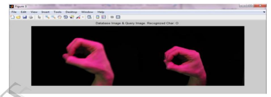
(Fig. D).Matched Database image Vs Input query image for character O

This input image representing character O is a colour image. When this is applied as an input query image, it matches with the scaled image of character O present in the database. Matlab tool compares the input/ accepted images with database image and give the appropriated output to the processing block.