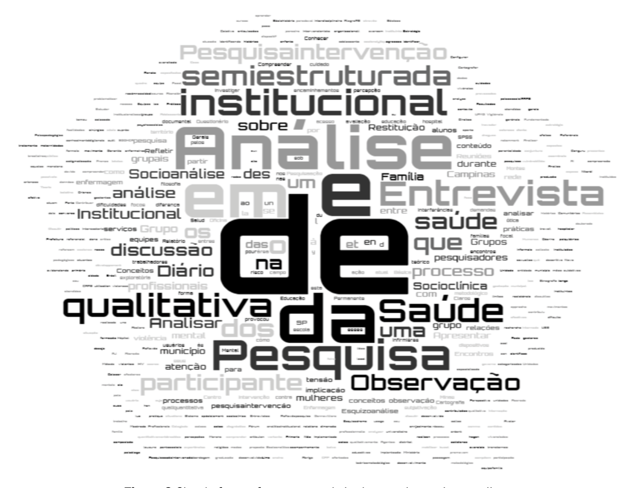
Figure 2 Cloud of most frequent words in the scoping review studies.

Regarding the distribution of studies by region in Brazil, the majority was from the Southeast (24) (São Paulo-12, Minas Gerais-7, Rio de Janeiro-5), followed by the South (4) (Paraná-2, Rio Grande do Sul-2), then the Northeast (2) (Natal-1, Rio Grande do Norte-1), Center-West (2) (Mato Grosso-2) and the North (0). It is worth mentioning that four articles had foreign authors: one from Canada, one from Argentina, and two from France. Based on the concept of IA it was possible to realize that in the scientific analysis of research occurred a multiplicity of concepts of IA that served as a foundation for the production of knowledge in health, however the most used was the concept chosen to compose this scope review, i.e., the concept of institution, always considering the three moments that compose it: instituted, instituting and institutionalization. In the selected articles, the following words were highlighted: IA (611 citations), public health (498 citations), collective health (348 citations), instituted (343 citations), institution (298 citations), institution (236 citations), intervention research (181 citations), instruments and tools (175 citations), primary care (165 citations) and education (143 citations), among others, as can be seen in the word cloud prepared with the support of WebQDA software (Figure 2).