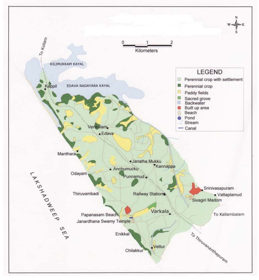
Figure-2 Map showing the landuse pattern of 1969