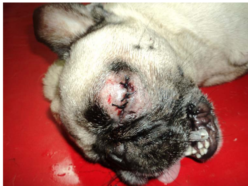
Figures 2. Corneal ulcer treated in pug.