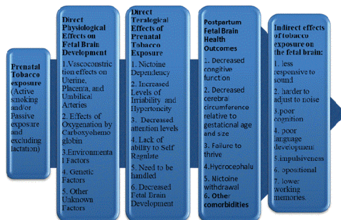
Figure 1. Biological model.

The neuro system which is composed of the brain and spinal cord is the first system to be formed immediately after conception. The development of human brain is a continuum process that begins in gestation and continues during childhood and right up to early adulthood (according to a 2016 report in the journal Environmental Health Perspectives), in this nervous system, are neural cells or neurons which help in message transmission throughout out body. These cells keep on multiplying, differentiating and maturing during this continuum process of brain development. So, any interference during the process can lead to a permanent defect on the baby's outcome