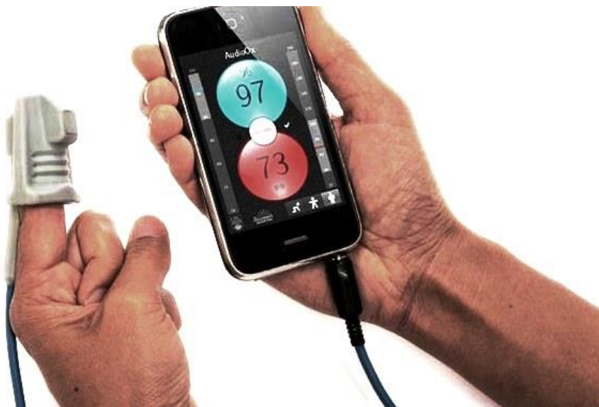
Figure 1: Using of mHealth technology for knowing the pulse rate by mobile device