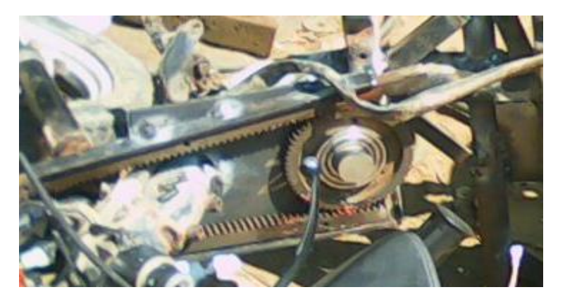
Fig. 6. Mounting of the rack on the gear