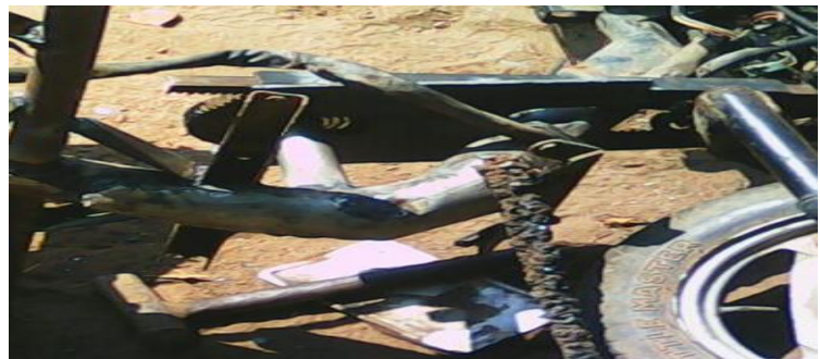
Fig. 5. Fabrication of the shaft to the base

The gears and the racks are mounted on a sheet of mild steel of 14" gauge and it is cut into the required shape using oxy-acetylene gas such that it supports the gear and the rack. The rack is welded with plates to arrest its movement and to avoid the mechanism from moving out of place. Two hex key bolts are taken and they are welded on their bolt heads on the larger gear. The threaded side of the bolts is facing the upper side. Two angular plates having the same length and thickness are bent in uniform shape. The ends are drilled to the diameter of the hex bolt and are inserted in the bolts and tightened with the help on nuts. The angular plates now act as the foot rest for the driver. The acceleration and braking pedals are fabricated on the foot rest. The pedals are fitted with springs so that they have easy retraction when they are subjected to movement. The braking and acceleration lines are given to the braking and acceleration pedals mounted on the left and right sides respectively. A circular plate is fitted with the switches and the plate is drilled to fit in the hex bolts. This means that the entire control system of the vehicle is now transferred near the foot of the driver.