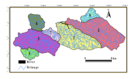
Fig. 3 Drainage map of the Payaswini watershed showing sub-basins

Toc H Institute of Science & Technology, Arakunnam, Kerala, India during 16th - 18th July -2014