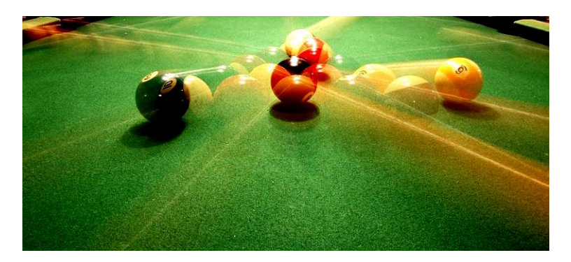
Figure 5: Pool 800px image with 0° Angle depicting Motion Blur with Slow Shutter Speed