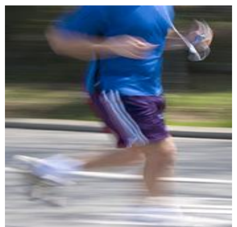
Figure4: Motion Blur produced using Lower Shutter Speed

When a slower shutter speed is selected, a longer time passes from the moment the shutter opens till the moment it closes. More time is available for movement in the subject to be recorded by the camera. A slightly slower shutter speed will allow the photographer to introduce an element of blur.