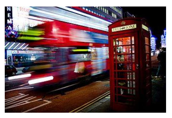
Figure1: Temporal Strobing

Motion blur is the apparent streaking of rapidly moving objects in a still image or a sequence of images such as a movie or animation and it is essential used for producing high-quality animations. In computer animation (2D or 3D) it is computer simulation in time and/or on each frame that the 3D rendering/animation is being made with real video camera during its fast motion or fast motion of "cinematized" objects or to make it look more natural or smoother. The frame rate of most films and videos is either 24 or 30 Hz, whereas human vision is reported to be sensitive up to 60 Hz. Due to the lower frame rate of film and video, when each frame is drawn as a simple instantaneous sampling of the dynamic phenomena, artifacts such as Temporal Strobing can occur. The graphics community has been aware of this Strobing and several motion blur techniques have been proposed to solve this problem.