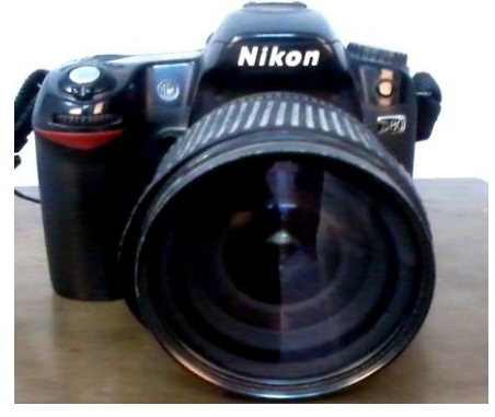
Figure3: Nikon Dx Camera and DSLR Lens

The study was performed in a Digital photographic Lab using professional lens and a professional Camera.