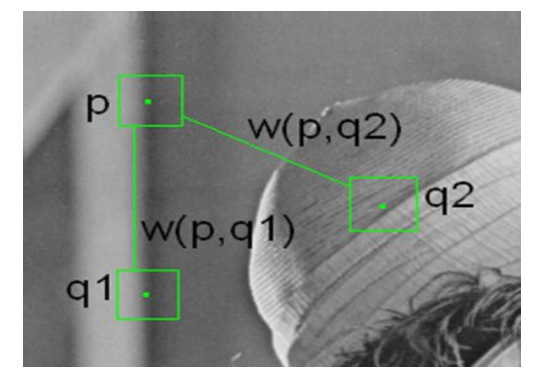
Figure 4.1: Example of self-similarity in an image.

Department of CSE, JayShriram Group of Institutions, Tirupur, Tamilnadu, India on 6<sup>th</sup> & 7<sup>th</sup> March 2014