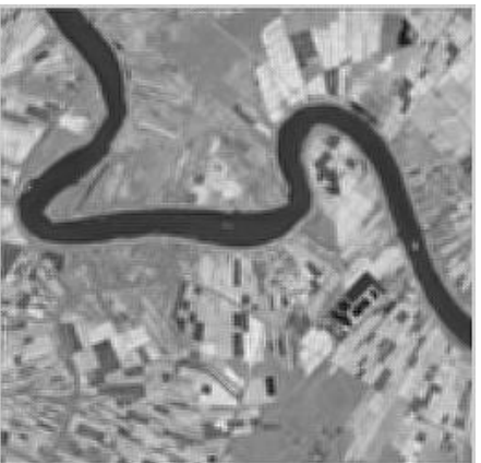
Figure 5.5: DT-CWT image without NLM

Following are the results of DT-CWT technique, which includes the process of Lanczosinterpolation and non-local means filtering.