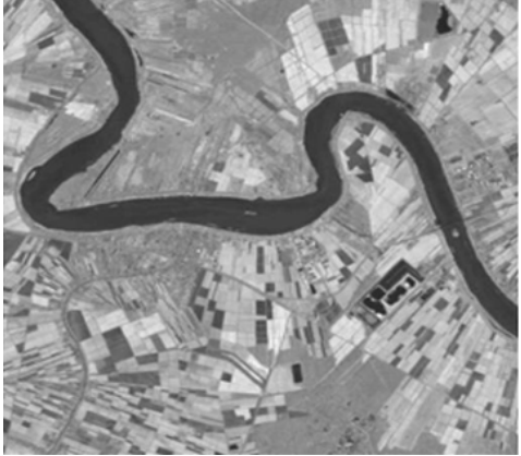
Figure 5.6: DT-CWT image with NLM

Department of CSE, JayShriram Group of Institutions, Tirupur, Tamilnadu, India on 6<sup>th</sup> & 7<sup>th</sup> March 2014