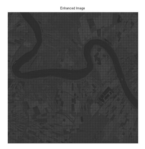
Figure 5.4: Enhanced image

Department of CSE, JayShriram Group of Institutions, Tirupur, Tamilnadu, India on 6<sup>th</sup> & 7<sup>th</sup> March 2014