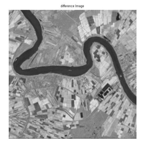
Figure 5.2: Difference image DWT based Wavelet transformed for Original Image

Department of CSE, JayShriram Group of Institutions, Tirupur, Tamilnadu, India on 6<sup>th</sup> & 7<sup>th</sup> March 2014