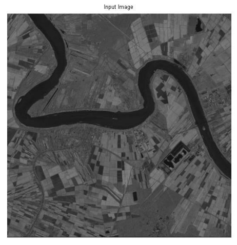
Figure 5.1: Low resolution image

During simulation different modules are processed and its results are shown below. Also its PSNR values are calculated and tabulated.