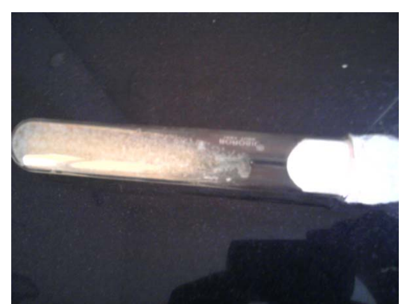
Fig 1: The Yeast Sporidiobolus salmonicolor (MTCC 485) on YM Agar media slants at 25°C.International Journal of Plant, Animal and Environmental SciencesPage: 282Available online at www.ijpaes.comPage: 282

The parent cultures of Sporidiobolus salmonicolor were procured from MTCC, Chandigarh and were maintained in the Department of Biotechnology, for the past 2 years and they were maintained at refrigerated condition (5- 7^{\circ} C) (Fig. 1).