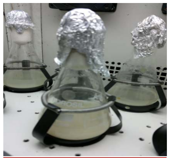
Fig 2: 250 ml screw-capped Erlenmeyer flask which contain Glucose medium.

The effect of incubation period, substrate variation, temperature and moisture on \gamma - Decalactone production was studied.