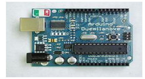
Fig. 3 Arduino Kit

The Arduino Nano, and Arduino-compatible Bare Bones Board and arduino boards may provide male header pins on the underside of the board to be plugged into solder less breadboards. The Arduino IDE is a cross-platform application written in Java, and is derived from the IDE for the Processing programming language and the Wiring project. It is designed to introduce programming to artists and other newcomers unfamiliar with software development. It includes a code editor with features such as syntax highlighting, brace matching, and automatic indentation, and is also capable of compiling and uploading programs to the board with a single click. There is typically no need to edit makefiles or run programs on a command-line interface. Although building on command-line is possible if required with some third-party tools such as Ino. There are a great many Arduino-compatible and Arduino-derived boards.