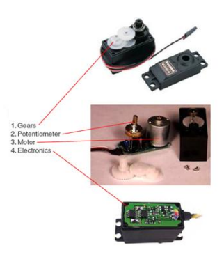
Fig. 5 Servomotor Structure