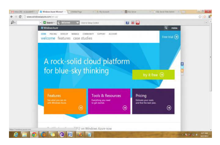
Fig3. Window Azure Cloud

Windows azure server is an online development and storage portal termed as cloud server of MICROSOFT where the data is to be migrated.