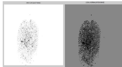
Fig.2 Normalized Images

We reconnoiter the experimental results in the first stage enhancement of the scheme in the fig.2 to get normalized images. This step takes input as a low quality fingerprint image and used to reduce the local variations and standardize the intensity distributions in order to consistently estimate the local orientation. The pixel wise process does not change the clarity of the ridge and furrow structures but reduces the variations in gray-level values along ridges and furrows, which facilitates the subsequent processing steps. img(i, j) is the gray-level value of the fingerprint image in pixel (i, j) , nor\ img(i, j) is the normalizing value in pixel (i, j) , and coeff is the amplificatory multiple of the normalized image. M is the mean of the sub image, and V is the variance of the sub image. M0 and V0 are the desired mean and variance values, respectively. In the experiments, we used M0 = 128 and V0 = 128 \times 128 .