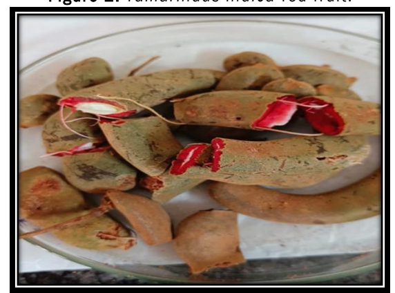
Figure 2. Tamarindus indica red fruit.

Therapeutic applications: It is used as anti-fungal, astringent, anti-inflammatory, anti-septic, anti-bacterial agent. In day today life even tamarind was used as part of cooking ingredient which imparts sour taste to food. Tamarindus indica red fruit was shown in Figure 2.