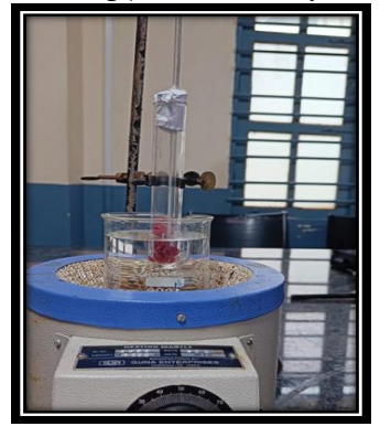
Figure 7. Melting point assembly of lipsticks.

Breaking point: Breaking point of lipsticks was ranging from 70 grams to 120 grams. As the wax content in the formulation increases there is frequent increase in breaking strength is been observed. Formulation F_5 shows maximum breaking point and formulation F_1 shown least breaking strength because of lesser amount of wax content. The breaking strength results were depicted in Table 7. Breaking point assembly was depicted in Figure 8.