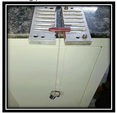
Figure 8. Breaking point determination of lipsticks.

Perfume stability: Perfume stability of lipsticks was carried out at 15<sup>th</sup> and 30<sup>th</sup> day. All formulations shown good perfume retention property at the end of 30<sup>th</sup> day and the results were depicted in Table 8.