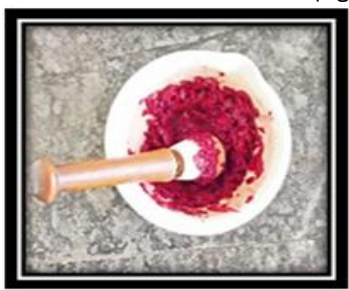
Figure 3. Extraction of natural pigment from Tamarindus indica red.

The colour pigment from Tamrindus indica red fruit was obtained by trituration followed by evaporation method. The dark red natural pigment from Tamridus indica red was obtained and stored in a refrigerator for further lipstick development process. The extracted pigment was shown in Figure 3.