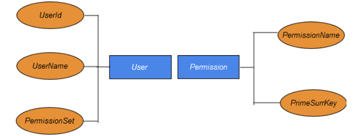
Figure 1. ER Model of M:N after Prime Factor Approach

So PermSet of 30 includes Dashboard_View, Add_Or_Update_Users and Delete_Users permissions. Now the Database Model will become