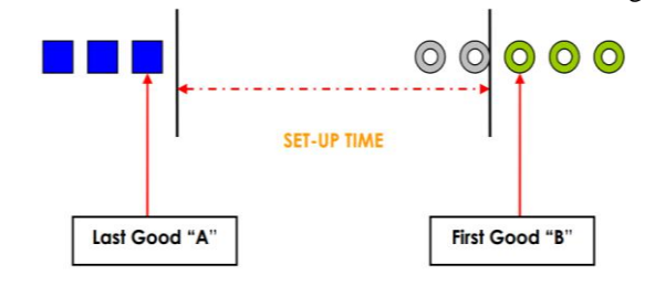
Fig 2. Set up time

Internal set-up is the change over activities which can only be done when the machines stop or shut down. External set-up activities can be done while machines are running. The aim is to do most of the change over activities while machine is in operation so that the idle time of the machines will be reduced. From the figure 2, it is understood that eliminating internal activities as much as possible will reduce the setup change over time i.e., the time when the machine is not running.