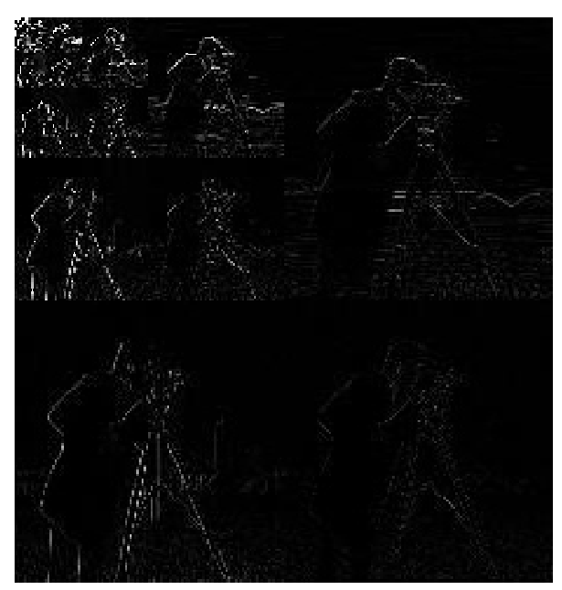
Fig 3: Partition Image Up to 8 Levels

The input image is 8 bits per pixel, gray scale test image, 'Cameraman' from MATLAB toolbox is utilized in the simulation has a resolution 256x256 pixels.