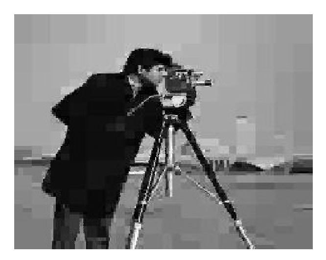
Fig 5: Received image after encoding and decoding