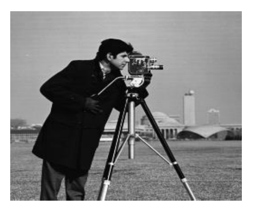
Fig 2: Original Image For Wavelet Transform.

The input image is 8 bits per pixel, gray scale test image, 'Cameraman' from MATLAB toolbox is utilized in the simulation has a resolution 256x256 pixels.