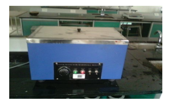
Figure 3.1 Steam curing unit

Curing may be done either by steam curing or water curing, in this present study curing of aggregates can be done by 28days water curing.