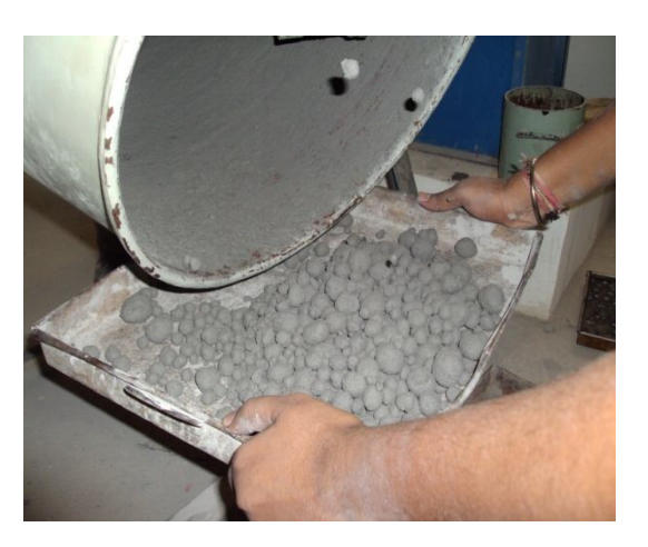
Figure 3. Collection of fly ash aggregates from mixer

The contents were thoroughly mixed in concrete mixer until the formation of fly ash aggregate. The method of formation is called pelletisation. Once the aggregate formed from the mixer allowed to dry for a day dried aggregate carried for 7, 28days for water curing and two days of steam curing at 80 degrees C is carried.