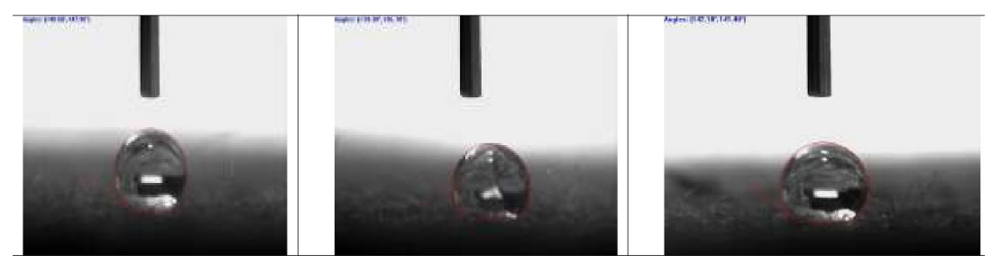
Figure 4. Contact angle images.

We can see in the following pictures the high hydrophobic property of this fabric and the table with contact angles (Figure 4) (Table 6).