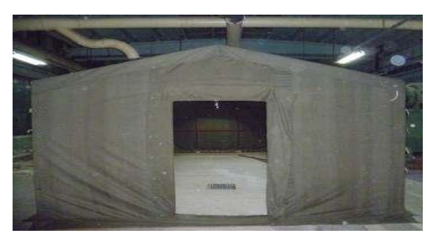
Figure 5. Shelter for emergency situations.

Technical fabrics with specific properties destined for satisfying technical and social requirements, have been characterized by the parameters of raw materials, structure and finishing. The finishing ensures water proofing, fire proofing and/or anti-microbial properties.