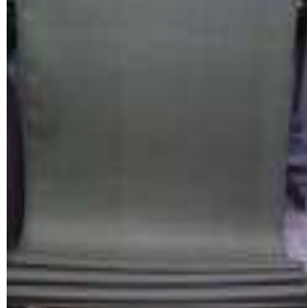
Figure 3. Finishing of the fabrics.

The selected raw materials: cotton twisted yarns Nm20/4 and Nm10/2, processed on the machine STB2-216 and polyester filamentary yarns 80dtex/32f/350z, processed on the machine Somet Thema 11. Three new types of fabrics have been performed within the research activities: woven fabric from 100% twisted cotton yarns (performed on non-conventional weaving machine with micro-shuttle STB 216), woven fabric 100% multi-filamentary Polyester (on the gripper weaving machine SOMET THEMA 11) and a woven fabric from Polypropylene (on a classical weaving machine with shuttle).