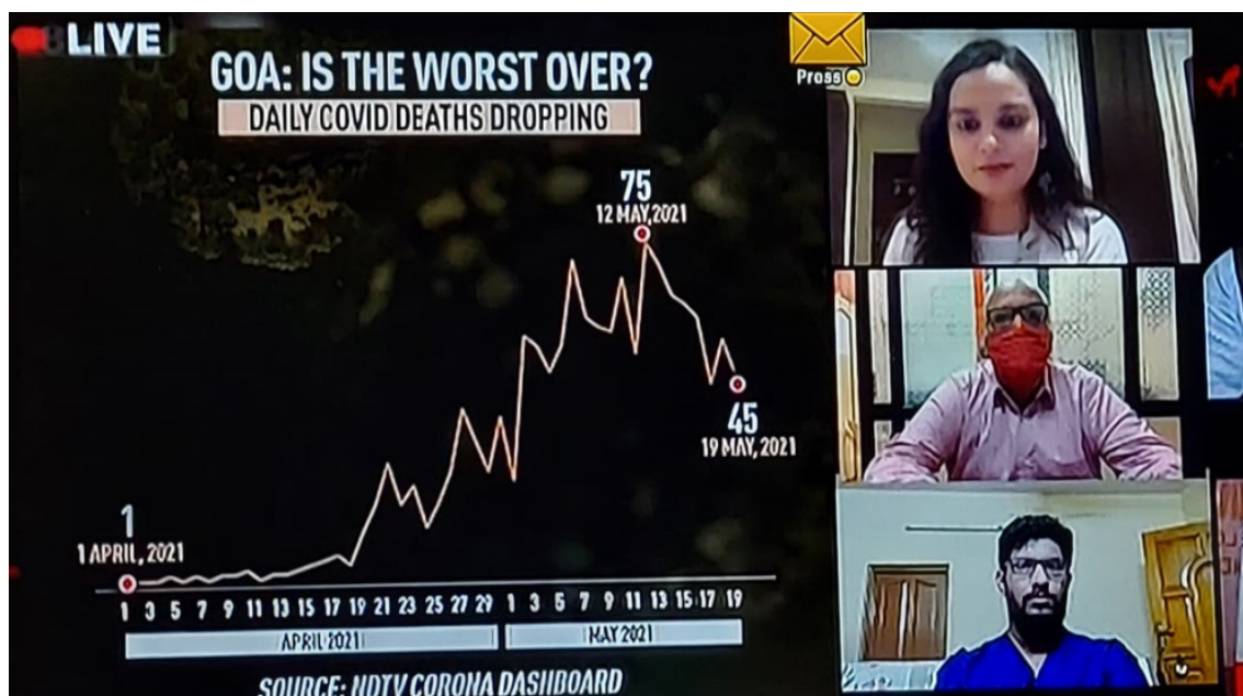
Figure 2. Goa: Is the worst over?