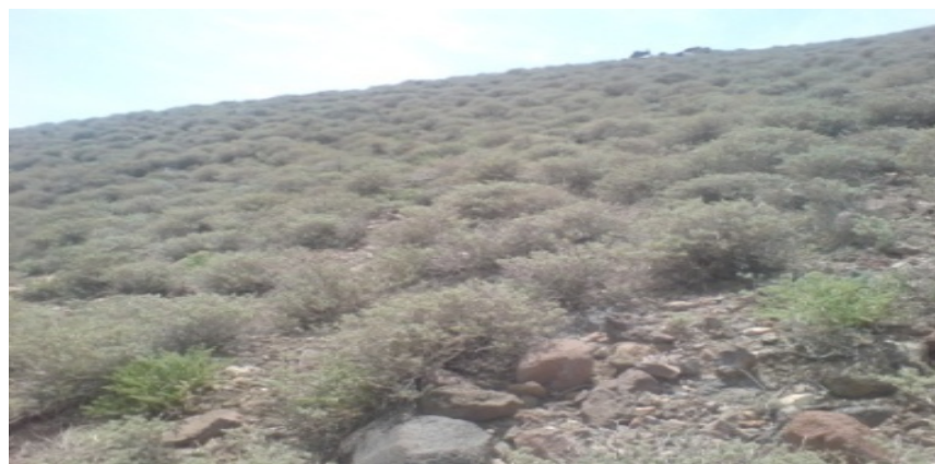
Figure.1 Taftan rangelands cover

The studied region is placed in Khash city of Sistan and Balouchestan Province at southeast of Iran. This zone is located in center of the province and at the end of Iran-Tourani continent and near Khalij-Omani continent. The pastures of the region are expanded from the plains with a height of 1382 meters to tall mountains with a height of 4042 meters at Taftan peak. The mean annual rainfall and temperature of Khash is 160 ml and 19.7 °C, respectively. The Exo Terra Monsoon Rainfall System also affects the regions. Besides, altitudinal gradient has provided different rainfall conditions there so that the statistics of 23 rain gauge stations, with exiting the plain and entering slopes of Taftan, show the rainfall will be increased and reached to 180 ml and 260 ml in heights of 2000 m and 4000 m, respectively[22]. These conditions have caused richer vegetation compared to other sections of the zone (Fig 1).