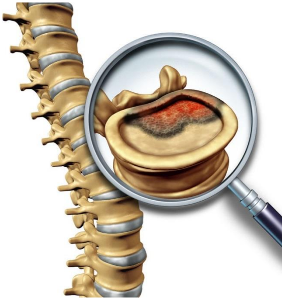
Figure 1: Spinal cord showing the spinal tumor.

Essential spinal tumors fall into an unmistakable classification in light of the fact that their opportune finding and the prompt establishment of treatment enormously affect the patient's general guess and seek after a cure [90-94] .