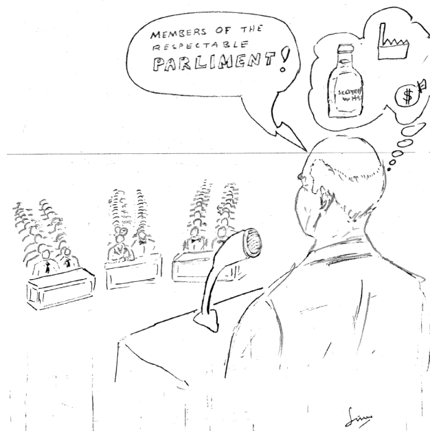
Figure 1. Big entrepreneurs possess a lot of political influence (illustration by the Author-SQ)

The absolute French monarchy gave way to a limited authority as permitted by a written constitution. The top man now was conceived as the office-holder for serving the people. All citizens, including the nobility and the clergy, became equal before the law. Toleration of other religions was granted. A nationalistic enthusiasm fusing all classes into a common body was inspired. In short; the leading dimensions of liberalism had been brought to the front [3] . The champion was the new bourgeoisie class. TKhe effects soon propagated like waves onto the whole continent (the Ottoman Empire being no exception). Even in Tsarist-Russia the positions of the nobles were deteriorating vi-à-vis the enriching Russian bourgeoisie class. Such hidden transcrips can be detected from literature works, like those of playwright Chekhov. In The Cherry Orchard , the newly-rich merchant Lopahin steadily betters his situation at the expense of the declining aristocracy. Below are interesting extracts. Lopahin is speaking "Your brother calls me a vulgar profiteer But what do I care!" (At a later episode) "Your cherry orchard is to be sold to pay your debts. But don't you worry, my lady! The cherry orchard must be leased [to me] to build bungalows and as soon as possible! [Otherwise] the auction is right on top of us!" (At still a later episode) "Musicians, play up! All must be as I wish it. Here comes the new master, the owner of the cherry orchard! I can pay for everything!" ( Figure 1 ).