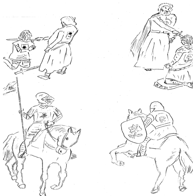
Figure 2. Scenes related to the War of Roses in Britain.

preparing military uniforms [5] . “Within the space of a short time, great cities arose. In all their life and works Americans swowed an astonishing ingenuity, a thirs for quickness and novelty, the outcome of their restless adventure in subduing a continent” [4] .