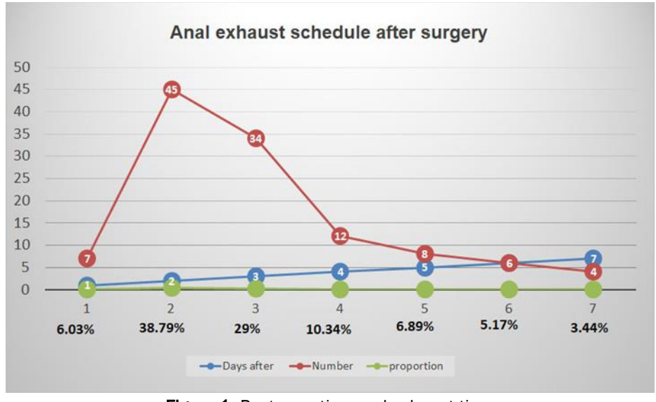
Figure 1: Postoperative anal exhaust time

In our hospital, most of the early gastric cancers do not have these conditions (no cases of anastomotic fistula), it can be ignored, and the rest have no ND. The average postoperative hospital stay is 5-7 days. There is no evident medical record of anastomotic leakage cases and a small amount of abdominal effusion in the abdominal cavity was seen. It was improved after the accurate puncture and drainage using ultrasound sonography. During this period, ND was not used and there was no obvious other case showing significantly earlier first exhaust time (20-40 hours) after the operation (Figure 1).