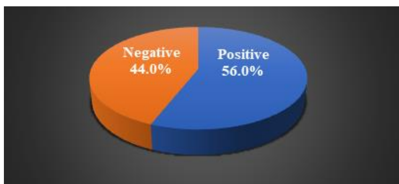
Figure 1. Total positive and negative samples.

Table 2 shows information about brand-wise positive and negative bottled water samples collected from Gondia city. It is apparent that out of a total of 50 samples 28 samples were positive whereas 22 samples were negative concerning the presence of bacteria. Samples of a total of 13 brands (Figure 2) were collected in the study;