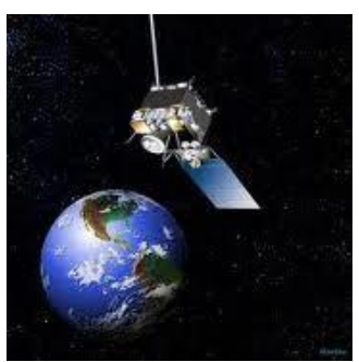
Fig 1. Example of weather monitoring by satellite

The first weather satellite to be considered a success was TIROS-1, launched by NASA on April 1, 1960. TIROS operated for 78 days and proved to be much more successful than Vanguard 2. TIROS paved the way for the Nimbus program, whose technology and findings are the heritage of most of the Earth-observing satellites NASA and NOAA have launched since then.