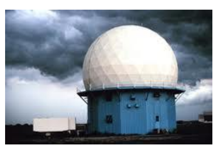
fig 2. Example of weather monitoring by radar

Meteorologists use radar to monitor precipitation. It has become the primary tool for short-term weather forecasting and watching for severe weather such as thunderstorms, tornadoes, winter storms, precipitation