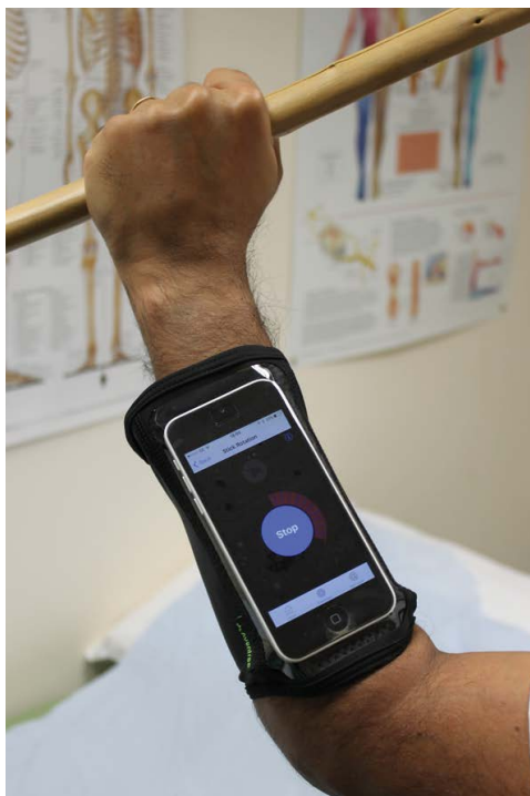
Figure 3. Photograph of exercise setup.

A clinician is able to identify those patients who are non-compliant, who would then require encouragement, as well as those who are progressing rapidly and whose exercises should be altered accordingly, as in the case of professional athletes. We therefore undertook this case study on a volunteer who had sustained a traumatic upper limb injury to trial this remote platform.