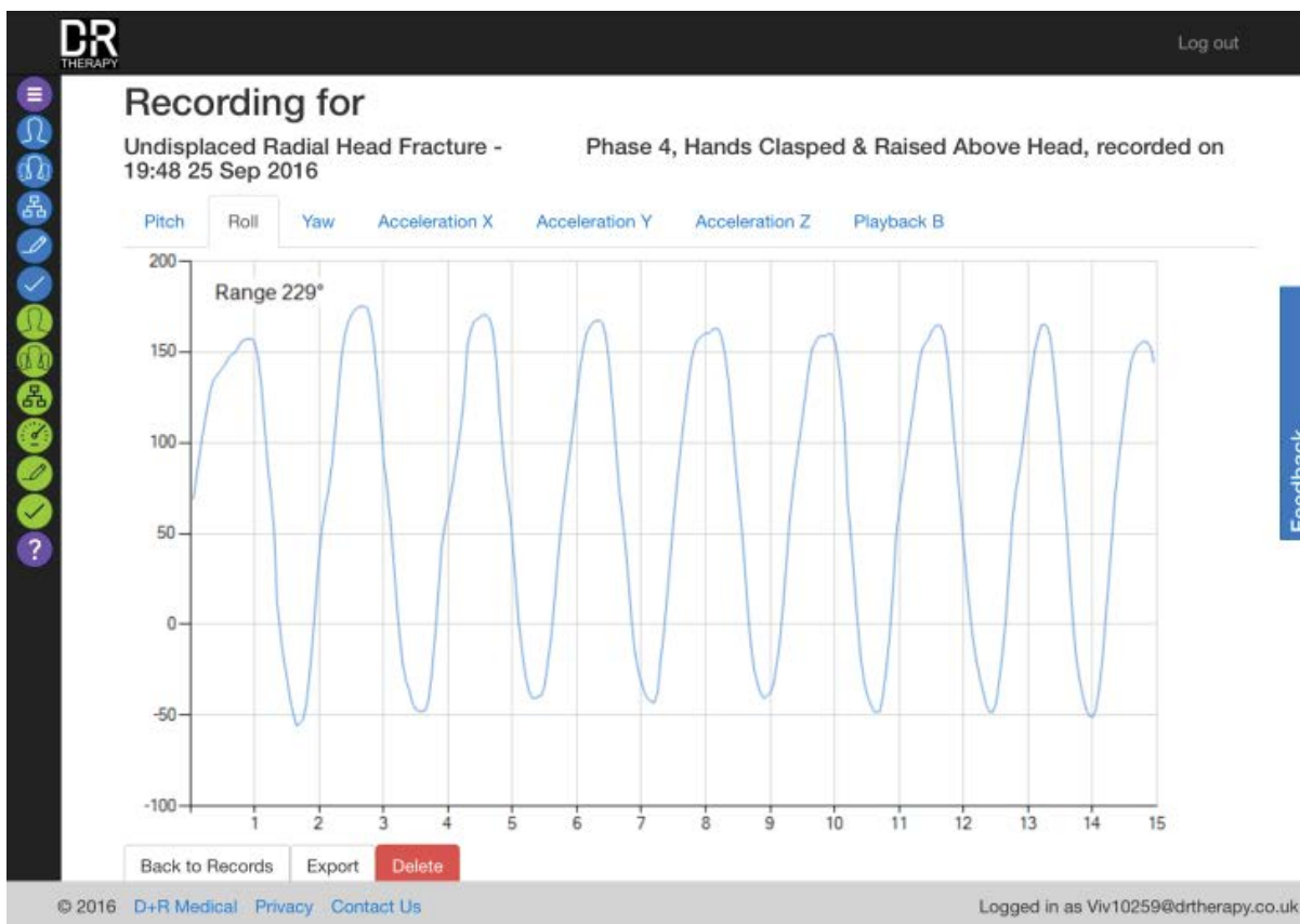
Figure 4. Performance feedback on specific exercise.