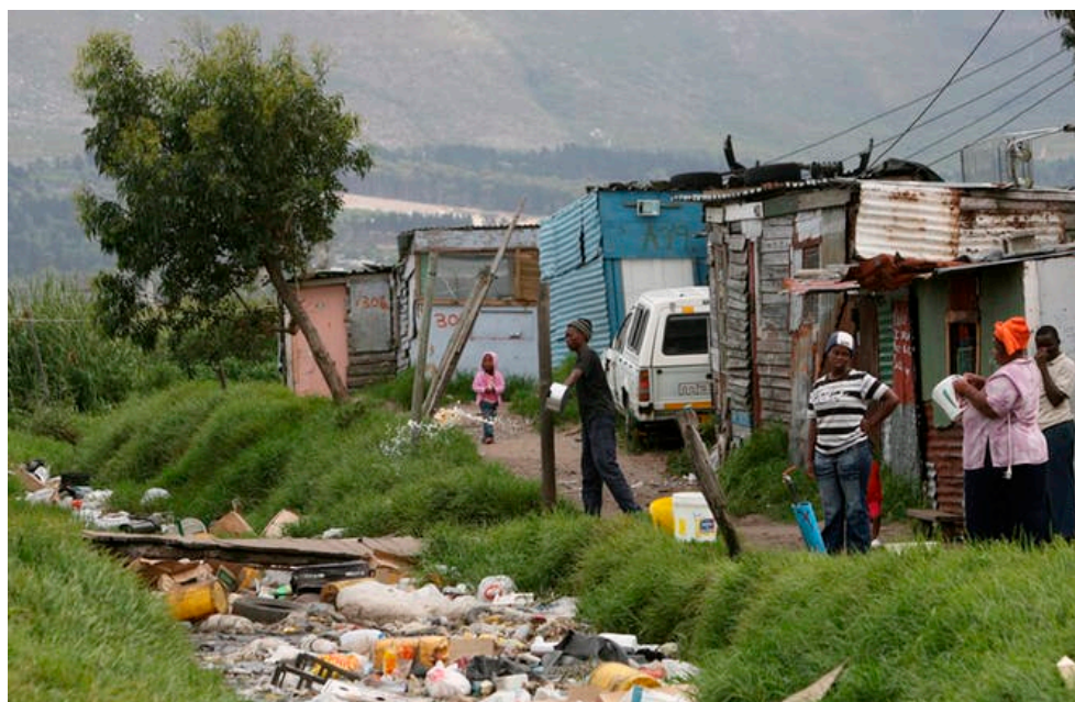
Figure 3: Photo: EPA/Nic Bothma: A large number of poor South Africans live in informal settlements. South Africa is set on fixing its economy. But will poor people benefit? Source: Adopted from Danny Bradlaw, (2018), “South Africa is set on fixing its economy. But will poor people benefit”? Pretoria: The Conversation, October.