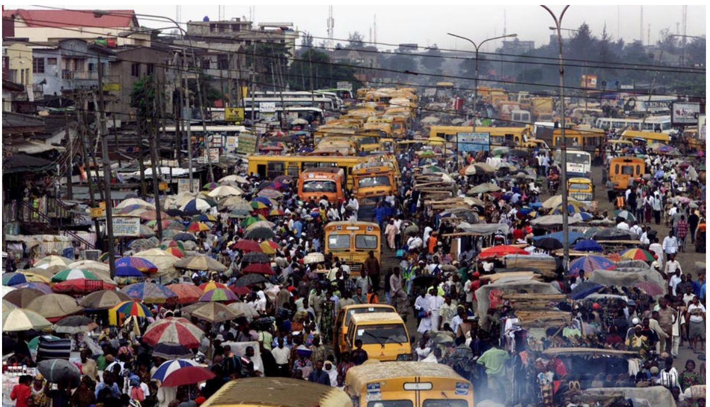
Figure 5: With a population of over 25 million people, this is just one area in the city of Lagos, Nigeria, expressing the breadth of poverty conditions for millions of people in sub-Saharan Africa. A different measure of poverty showing how 70% of the world's poor, live in what the World Bank considers middle-income countries. (Source: Nilsen [52], "Why The World Bank's Optimism about Global Poverty Misses the Point", The Conversation /EFE-EPA/Onome Oghene, The Universities of the Witwatersrand and Western Cape, October 2018).

According to Transparency International, "South Africa and Nigeria have diverse bribery levels, with South Africa standing at just 7 per cent; while Nigeria is at 43 per cent. Nevertheless, it is not all doom and gloom. In Mauritius and Botswana only 1 per cent of public service users say that have paid an official off, which is on a par with low bribery rate countries in Europe and North America (Figure 5).