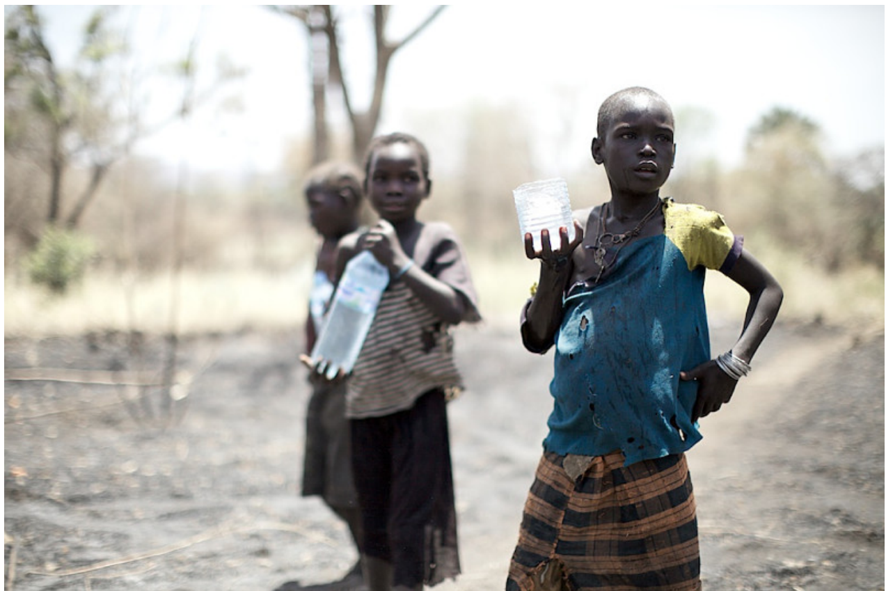
Figure 6: Nearly half the population in Sub-Saharan Africa lives below the international poverty line indices of USD 1 per consumption unit per day. Discussed below are five shocking statistics regarding poverty in Sub-Saharan Africa.

“a person can hope to live on average only 46 years, or 32 years less than the average life expectancy in countries of advanced human development, with 20 years slashed off of life expectancy due to HIV/AIDS.” Thankfully, HIV death rates are decreasing across sub-Saharan Africa. In Rwanda, AIDS-related mortality rates dropped from 7% to 5% from 2011-2012. Similarly, in Uganda the life expectancy was raised by ten years between 2000 and 2013 from age 46 to 55. Foreign aid and the distribution of HIV/AIDS medication have played a large role in this reversal. Some 48.5% of the population lives on less than $1.25 per day, and 69.9% on less than $2.00 per day. With a little over 910 million people living in the region, this places around 637 million Africans below the poverty line. HIV/AIDS and malaria are primary killers in sub-Saharan African countries. The UNAIDS estimates that, some 2 million sub-Saharan Africans perish each year from the disease. And 70% of the HIV/AIDS deaths were in sub-Saharan Africa. The region also lays claim to 90% of new HIV infections in children. In Namibia alone, 15,000 people die every year from the disease. For instance in the Democratic Republic of the Congo appears to be the poorest country in Africa and the second poorest country in the world, with almost 88% of the population living on less than $1.25 a day. Forget [90] states, “with a population of 65.7 million people, 88% is an unnerving statistics.”