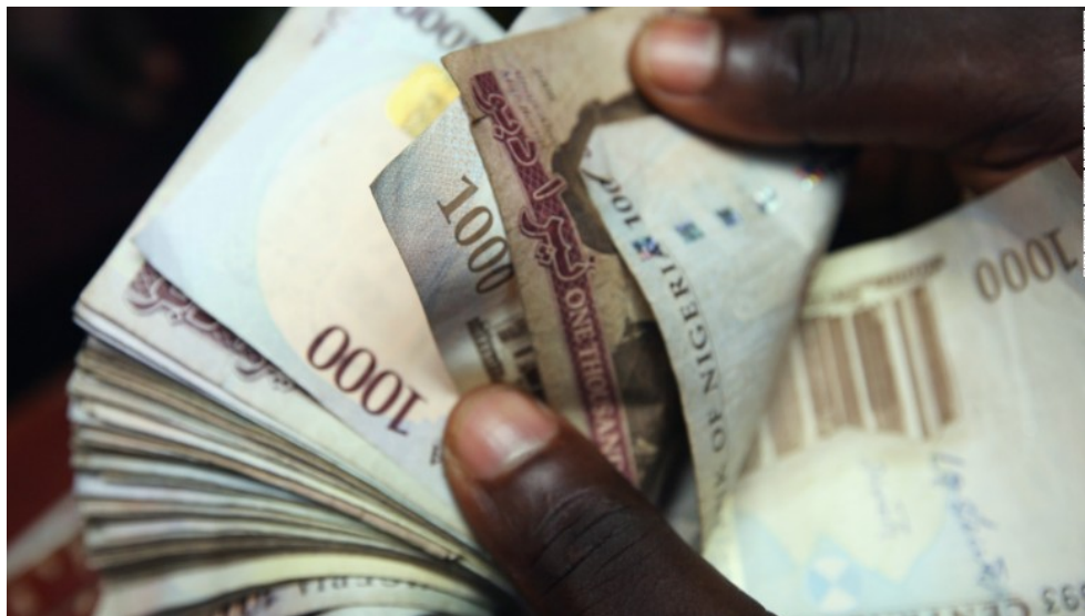
Figure 1: Corruption in Africa nay Nigeria – passing on money to divert resources to boost poverty and perversion in high or low public and private places in rife in Nigeria – the most populated country in sub-Saharan Africa (Source: The 2018 Report of Transparency International, a global corruption watchdog, in collaboration with Afro-barometer, an organisation which conducts surveys on governance in Africa).

According to CNN's Veselinovic [67] , report, "besides articulating and churning out inappropriate public and foreign policies, which represent the invisible hands of poverty and corruption sub-Saharan African countries', political leaders and the Bretton Woods Institution boost damaging mechanisms that prod poverty and corruption in the region." Thus, the data below represent the result of a survey conducted in 2016, to determine the extent and character of corrupt practices in selected sub-Saharan African countries. The list is not exhaustive, but it shows how corruption is perpetuated in the region ( Figure 1 ). As Chuta [68] , Masumbe [55] , observe, the institutionalisation of these practices is the product of inappropriate public policies, arising from dishonest, illegal and immoral behaviours, especially from people with high and powerful political offices. Corruption presupposes that a given system has a standard or blueprint of behaviours expected of persons who operate within that system."