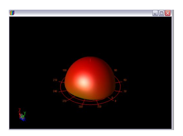
Fig.2. Radiation pattern

The geometry of the proposed antenna has been shown in Fig.1. The fractal antenna with coupling patches is used to improve conductivity. The design process begins with the radiating patch with substrate, ground plane and a feed line. It is printed on a 1.6mm thick FR4 substrate that contains dielectric loss tangent 0.0022, relative permittivity 4.6, and relative permeability with 1.