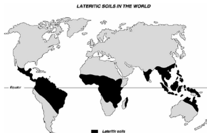
Figure 1. Distribution of laterites in the world.

Demographic expansion has resulted in a consequent demand for infrastructures, which in tropical Africa has resulted in the scarcity or non-availability in the vicinity of conventional aggregates commonly used for making concrete such as rolled gravel or crushed rocks. Laterites are metamorphic rocks that are red or brown in colour. They appear in the form of red earths mainly due to their iron oxide content. Ecological and available in the tropical region, lateritic soils are widely used as building materials in West Africa for rather light structural constructions according [1,2]. Laterites are widely distributed in most continents of the world, but particularly in the intertropical regions of Africa, Australia, India, Southeast Asia and South America (Figure 1).