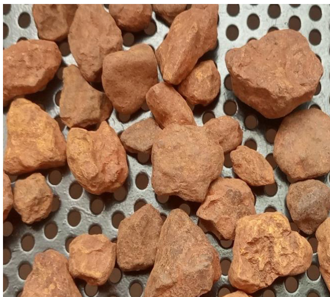
Figure 2. Lateritic nodules.