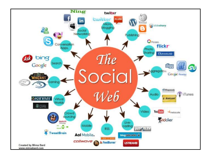
Figure 4: THE SOCIAL MEDIA REACH

As per the research studies it has been revealed that the companies are revising their security model which takes into account the sharing of information and tweets across social networks. There are risks in the use of and social media channels which may be integrated with web services having one or more security flaws those are often not well recognized. The companies are educating its customers to keep them alert to what may happen and the precautions which can be taken thereof. They are even guiding the people to let them believe that the Internet is not a private place. Some big giants like Google, Amazon are informing the users about the advantages and of the risks of social networking sites. Generally the young users are more vulnerable and they should take care of the information being shared online with great cautiously. A legislation owned by law of the land needs be designed again to protect personal information online, and also to define and then to protect data ownership rights and behaviors in a web-based environment.