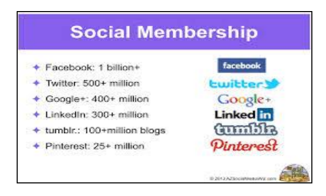
Figure 2-Million Users information on Social Media

Since millions of users are currently active over internet through various social media channels it is quite high time that their information can be easily stolen by a hacker due to even a minor security flaw in web service integrations.