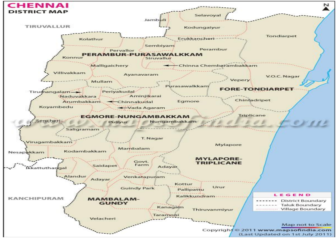
Fig. 1 Chennai district

home to approximately 8.9 million, making it the fourth most populous metropolitan area in the country and 31st largest urban area in the world. This urbanization paved us the interest to find the increase in temperature in the past few years in this area.