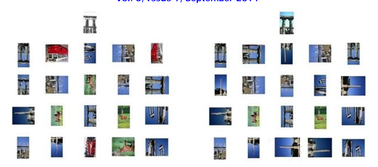
Fig 5: Shows Top 20 retrieved images of SBIR and CSBIR based on building image as query image

(An ISO 3297: 2007 Certified Organization) Vol. 3, Issue 9, September 2014