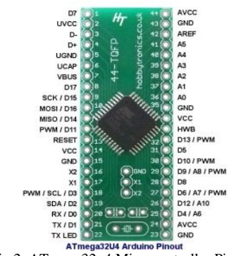
Fig.2. ATmega32u4 Microcontroller Pin out

The microcontroller is a mini computer built for specific tasks which contains memory, storage, input and output programs on a single Integrated Circuit. In Arduino Yun Board, ATmega32u4 is embedded for performing the operations mentioned above. The Pin out of ATmega32u4 is shown in Fig.2. This microcontroller is low power and high performance AVR 8 bit microcontroller with advanced RISC architecture. This microcontroller holds a flash memory with 32K bytes of In-System Self Programmable, 2.5K bytes of Internal SRAM, 1K bytes of Internal EEPROM. It supports the data transfer rates of up to 12 Mbit/s and 1.5Mbits/s, 12C and SPI communication. It represents the USB specification with 2.0.This microcontroller holds some features like Idle, Power-save, Power-down, standby, extended standby and ADC Noise Reduction. The maximum frequency produced for 2.7V is 8MHz, and the maximum general purpose working registers are 32 X 8.