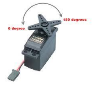
Fig.3. Servo Motor