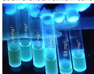
Figure 1. Qualification of the biosensor at different chromium concentrations.

In the research carried out by Huelves, et al., [16] the enzyme that catalyzes the luminescence reaction is encoded in the enzymatic protein of luciferase, an operon that was modified together with the chromium resistance genes by inserting into the Escherichia coli bacteria, thus obtaining a medium that translates into light emission.