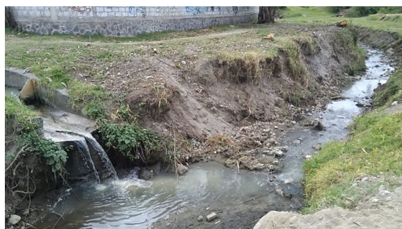
Figure 2. Urban wastewater discharge point to the Pichaví river.

Two levels were raised; the macro location that determined the most representative sections according to the total length of the Pichaví river; the micro-location that implied the equivalent division of the total length of the river, with a distance of 2 km between each point (Figure 3), a distance that must be considered according to the different methods applied in the field for the collection of a sample, due to the estimation of the total uniform mixture of water between each section, thus generating a total of 6 points for the collection of water samples [10].