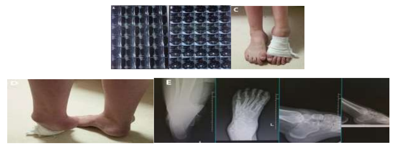
Figure 2. Lumbar MRI reexamination after spinal cord related surgery showed :(A and B) left fat mass was found in the spinal cord;(C and D) X ray of both feet showed: left and right heel pronation, left food plantar flexion;(E) Heel pronation in the left heel loading long axis position; Weight bearing position of left ankle showed plantar flexion of ankle, plantar flexion of first metatarsal;(F) Persistent plantar ulcers.

He underwent spinal cord surgery at that time. Six years after the operation, the left foot varus was significantly worsened, the left ankle flexion and extension was limited, the ankle joint plantar flexion was 70°, and the average range of motion was 10° (plantar flexion 10°-back extension 0°); tibialis anterior muscle and fibulamuscle strength level 0, tibialis posterior muscle strength level 2, Raise the medial longitudinal arch, plantar ulceration, sphincter bladder function paralysis, and catheterization bag for 5 years (Figure 2).