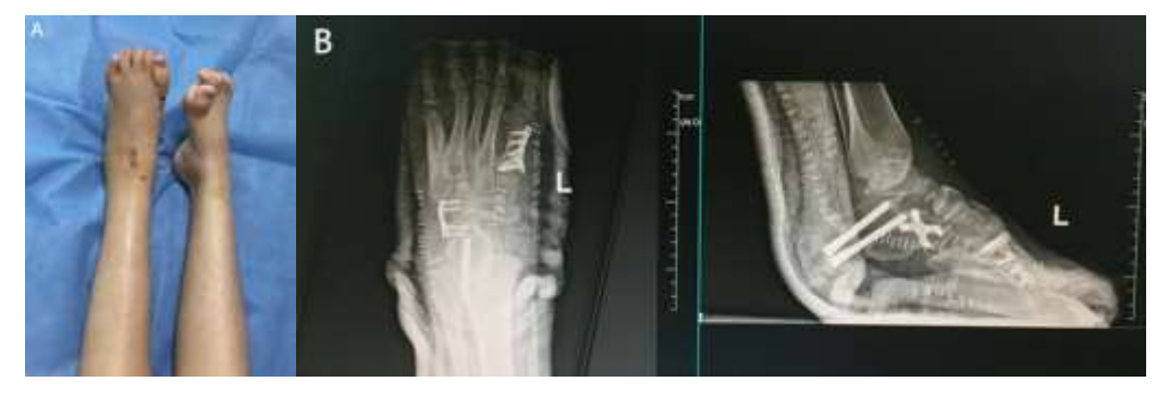
Figure 4. Postoperative results showed that: (A) the left foot Equinovarus deformity was corrected with A beautiful appearance, and the right foot deformity was not operated on; (B) Postoperative X-ray examination.

On the 35<sup>th</sup> day after the operation, patient is required to walk with two crutches or Help line device without weight. 60 days after surgery, partial weight-bearing walking exercise was started. After 90 days of surgery, walk with full weight and resume daily life (Figure 5).