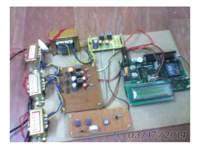
FIG: a) transmitter

The main working of this project is to continuously check the temperature, humidity and soil moisture conditions through internal ADC and displays the readings on the LCD display. If the reading goes beyond the threshold values then the specified person will be indicated through SMS using the GSM module, which is connected to the microcontroller. Fig a) shows the picture of transmitter of our system and fig b) shows the picture of receiver of our system that is placed in the agricultural field, which will sense the respective parameters and show the values on the LCD display and process it to send SMS through GSM to the user mobile.