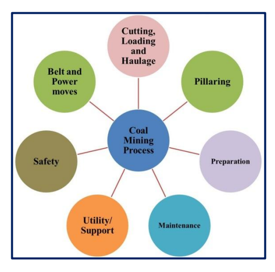
Fig. 3 Process work in Underground Coal Mining

There are a wide range of mining process improvement programs, since each company has its own unique goals and characteristics. As a result, companies follow different performance improvement models based on their needs, cultures and styles, while performance improvement programs differ across mining companies, the types of processes they address are similar, within each process, there are a wide range of issues that can be addressed (Table 1). An illustrative example ofUnderground Coal Mining Process is shown in Fig.3. [7-9].