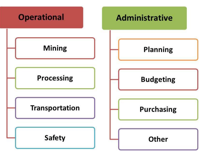
Fig. 1 General Operational and Administrative processes in mining industry

An overview of Operational (Mining, Processing, Transportation and Safety) and Administrative activities involved in mining industry are shown in Fig. 1; in this paper we are focussing on Operational processes.