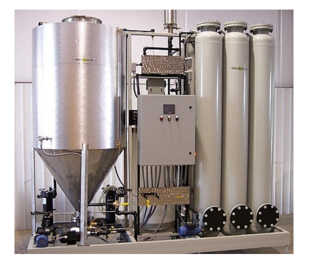
Figure 3: Biodiesel Processor