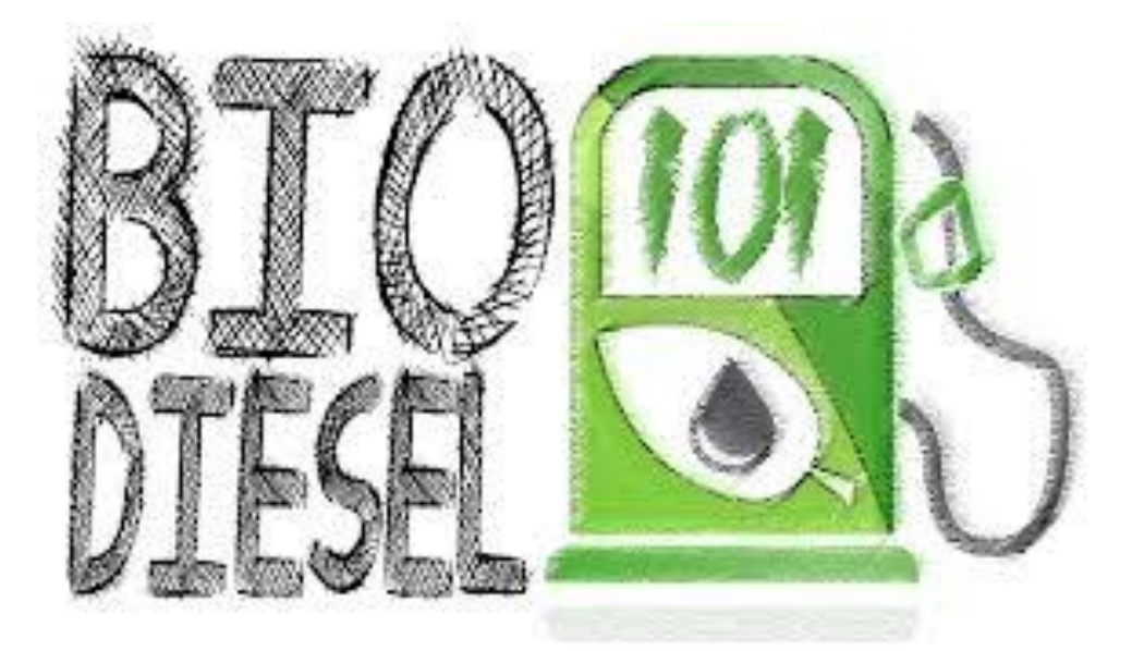
Figure 4: Portrayal of Biodiesel as a Renewable Source of Energy

such, the governments of the countries where there is shortage of petroleum has to spend more on the import of petroleum products thus, disrupting economic progress. Nowadays, fossil fuels corporations and companies are terming Compressed Natural Gas (CNG) as "future fuel". However, CNG is a non-renewable source of energy and confirmed reports say that its production will start dwindling as early as 2040. Now we are all familiar with the concept of GLOBAL WARMING. Earth is currently going through a period of global warming. Average worldwide temperatures are increasing rapidly. Factors which are contributing to the scene of global warming are many but figures show that burning of fossil fuels do give rise to rapid increment in the percentage of carbon dioxide in the atmosphere. But fortunately there is a solution-Renewable sources of energy. There is infinite amount of renewable sources of energy and vegetable oil is one of them. There is no need to think big from starting. If we contribute by making small changes then it will surely be noticeable in the long run. For e.g.- If your university has a transportation system, then we can make an effort to convince them to switch their fuels to biodiesel which will not only lessen the pollution in your area but also revolutionise the transportation system of your university.