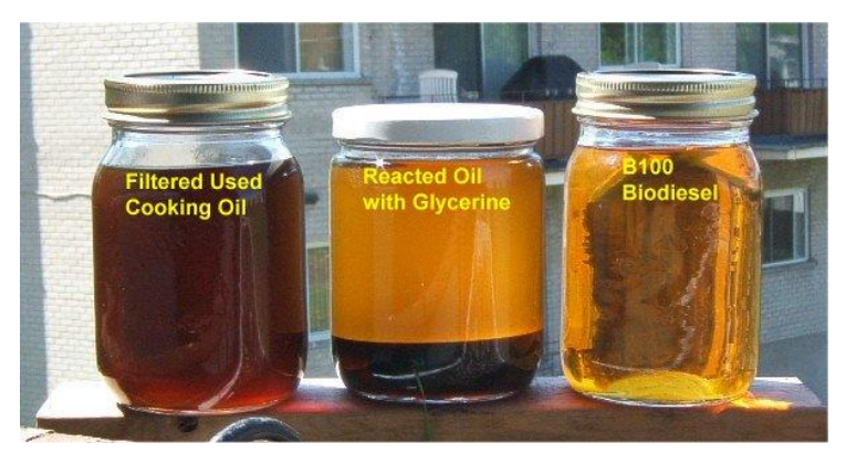
Figure 5: Fuels In Different Stages

Disclaimers aside, biodiesel is used all over the world. Island people are making biodiesel from coconut oil, some countries are experimenting with biodiesel from hemp seed oil, and many others are using canola oil. Millions of miles of road tests have been done with this fuel. Tests have shown less wear on the internal components of engines using biodiesel. Biodiesel is a reliable, exciting fuel that you can make. If you are worried about your diesel engine, you can install an extra fuel filter system from similar aftermarket parts manufacturer. After traveling over 25,000 miles (40,000 km) on biodiesel made from used cooking oil, we continue to choose and recommend biodiesel over toxic, carcinogenic petroleum diesel fuel.