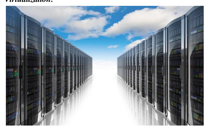
Figure-2. Data Center [1]

Data center as shown in figure 2 shows the actual realization of a data center. The data center is used for keeping vast amount of information. The racks in data centre are used to maintain equipment for keeping the data. Data center is useful in various applications in cloud computing.