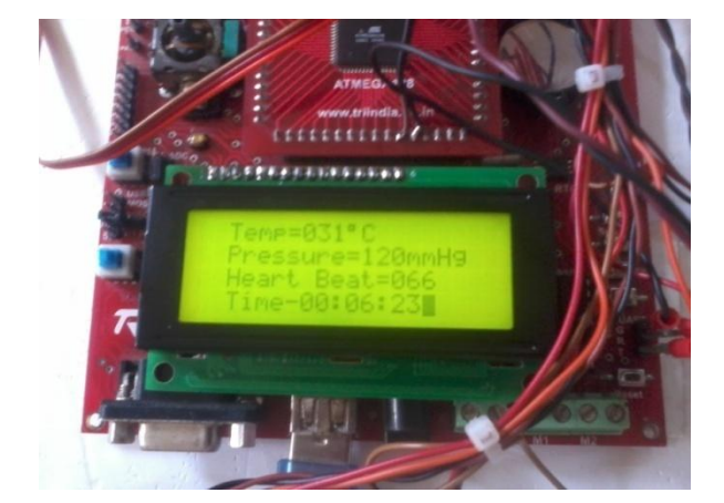
Fig.3 Display of proposed system