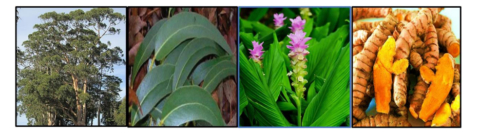
Figure 1. Plant investigated for this study. Eucalyptus globulous, Curcuma longa.

Large genus Eucalyptus comes under Myrtaceae family. This genus contains more than or equals to 900 different