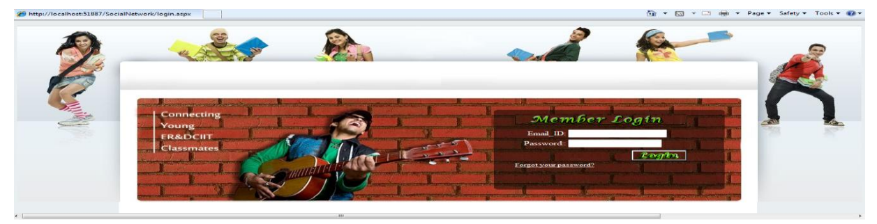
Fig. 1 Example of an Authentication