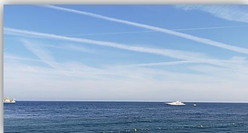
Figure 1. The red sea –Dead Sea canal project.

Vision 2030 is a plan for peace and overcoming dropped oil prices [18]. Saudi Arabia is the biggest oil exporter in the world, and its oil production costs are among the cheapest in the world [18]. Saudi GDP depends on oil export revenues.