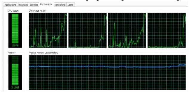
Fig.1:Task manger Performance view

Fig 1 shows that Task Manager Performance view of the proposed algorithm is running: