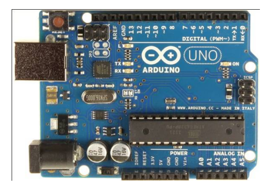
Fig. 2. Arduino board UNO

The Fig. 2 shows the hardware figure of the arduino board UNO. The above shown arduino board is of the type of ATmega328 arduino board .