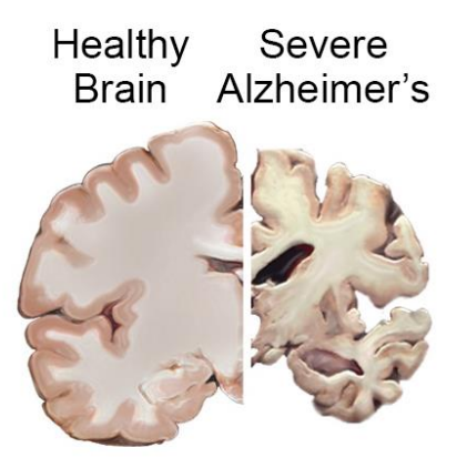
Figure 2. Cross sections of the brain show atrophy, or shrinking, of brain tissue caused by Alzheimer's disease.