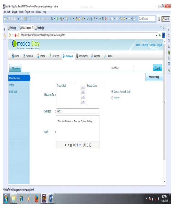
Figure 2.a: Facility of sending alert message to selected person

In our proposed system of advanced hospitality, there is facility of alert messaging that can be done by the hospital on regular basis, to properly and completely curing their patients [11]. This scheme work as our regular messaging which we done with our mobile. In this, there is Inbox, Sent box and new message typing and sending facility is available. This sending and receiving of message can be done by any doctor to any other expert or to patient or from any patient to any doctor in the hospital. Doctor can check, if his staff member should send the message to all patient or not and one can take proper action and make arrangement accordingly. If the patient is not following the alert messages then doctor can suggest the patient accordingly. The function of this messaging facility is done as shown in the following figures as Figure 2.a shows how new message can be send and Figure 2.b shows the record of all the sent messages.