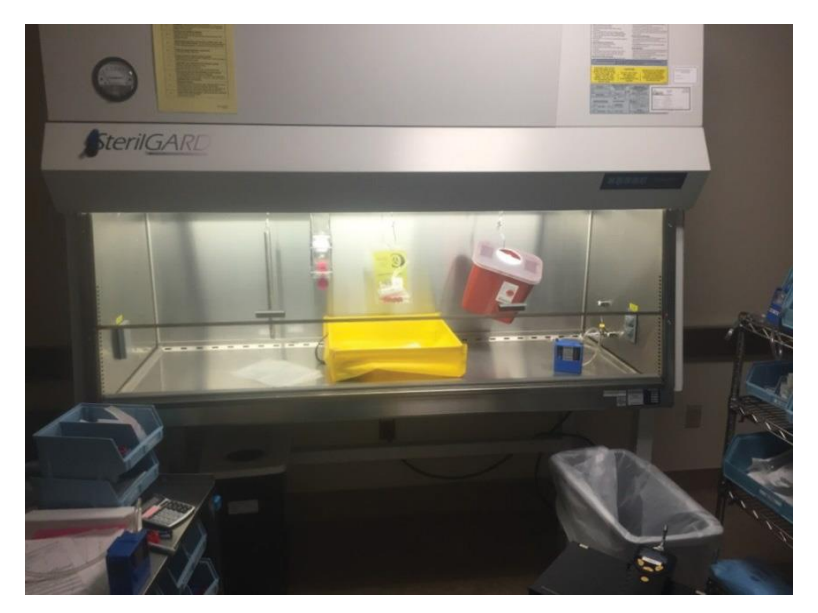
Figure 2. Typical air sampling set-up during a spill condition